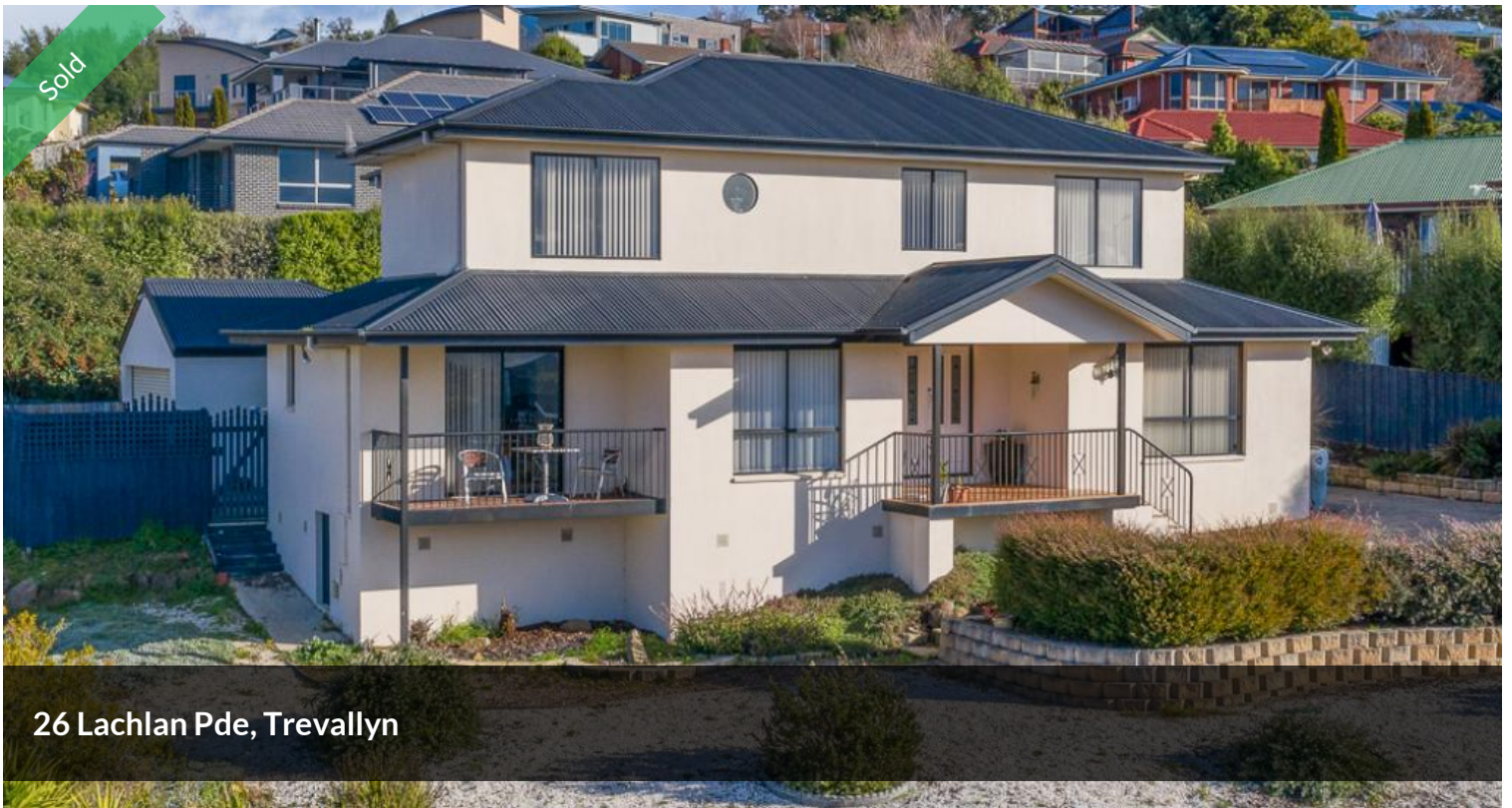
26 Lachlan Pde, Trevallyn