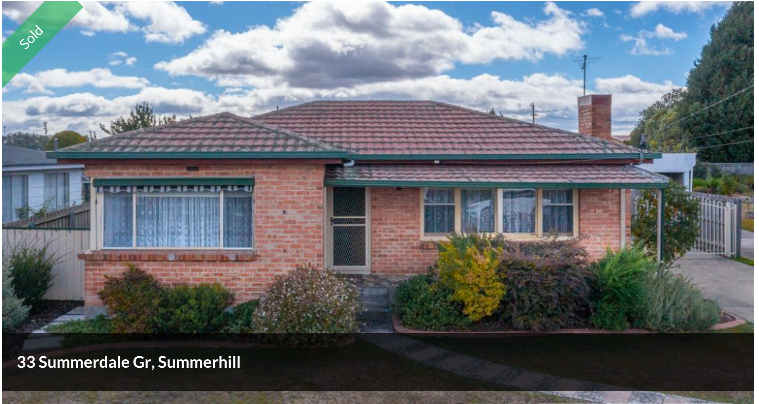
33 Summerdale Gr, Summerhill