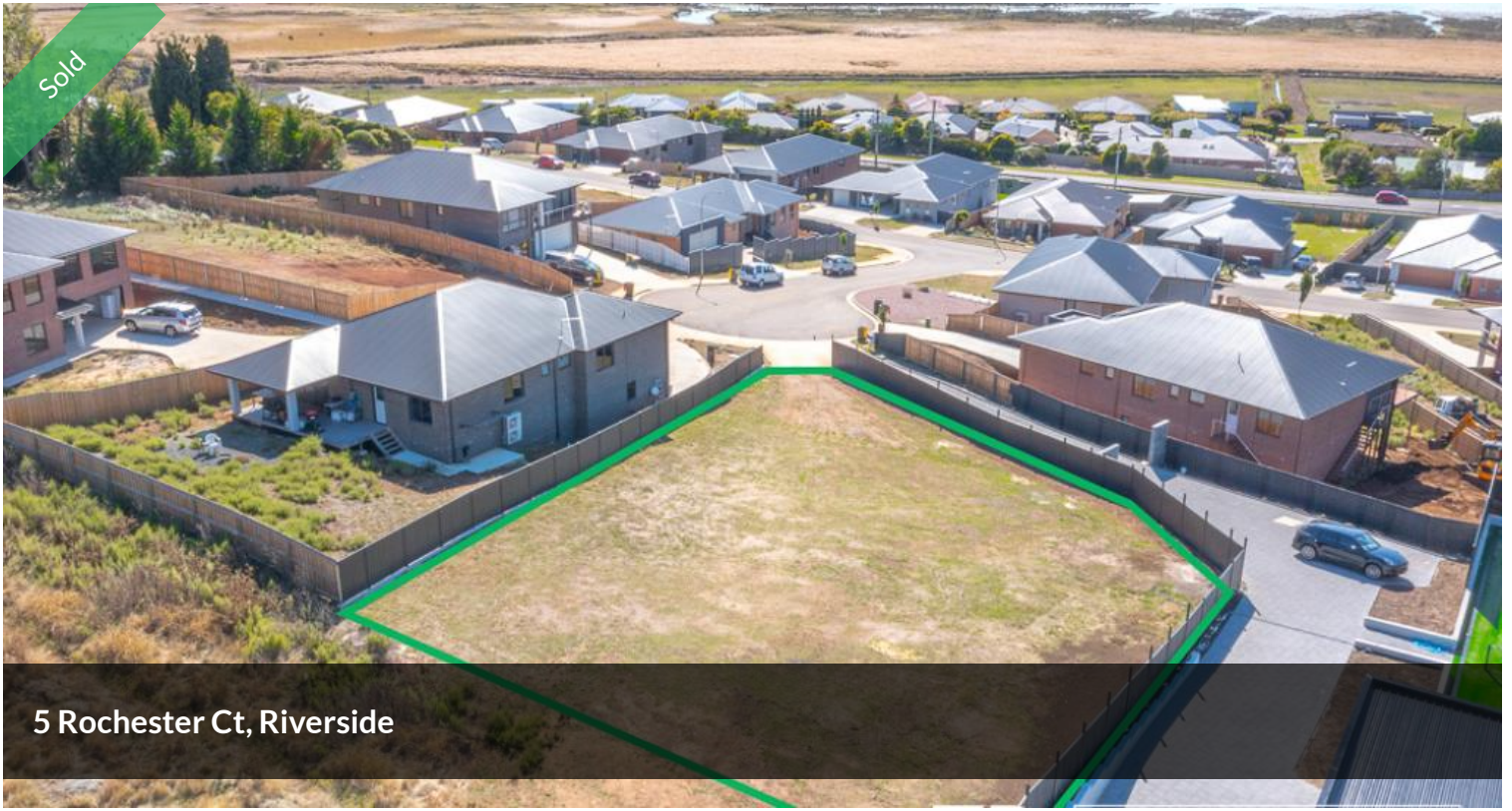
5 Rochester Ct, Riverside