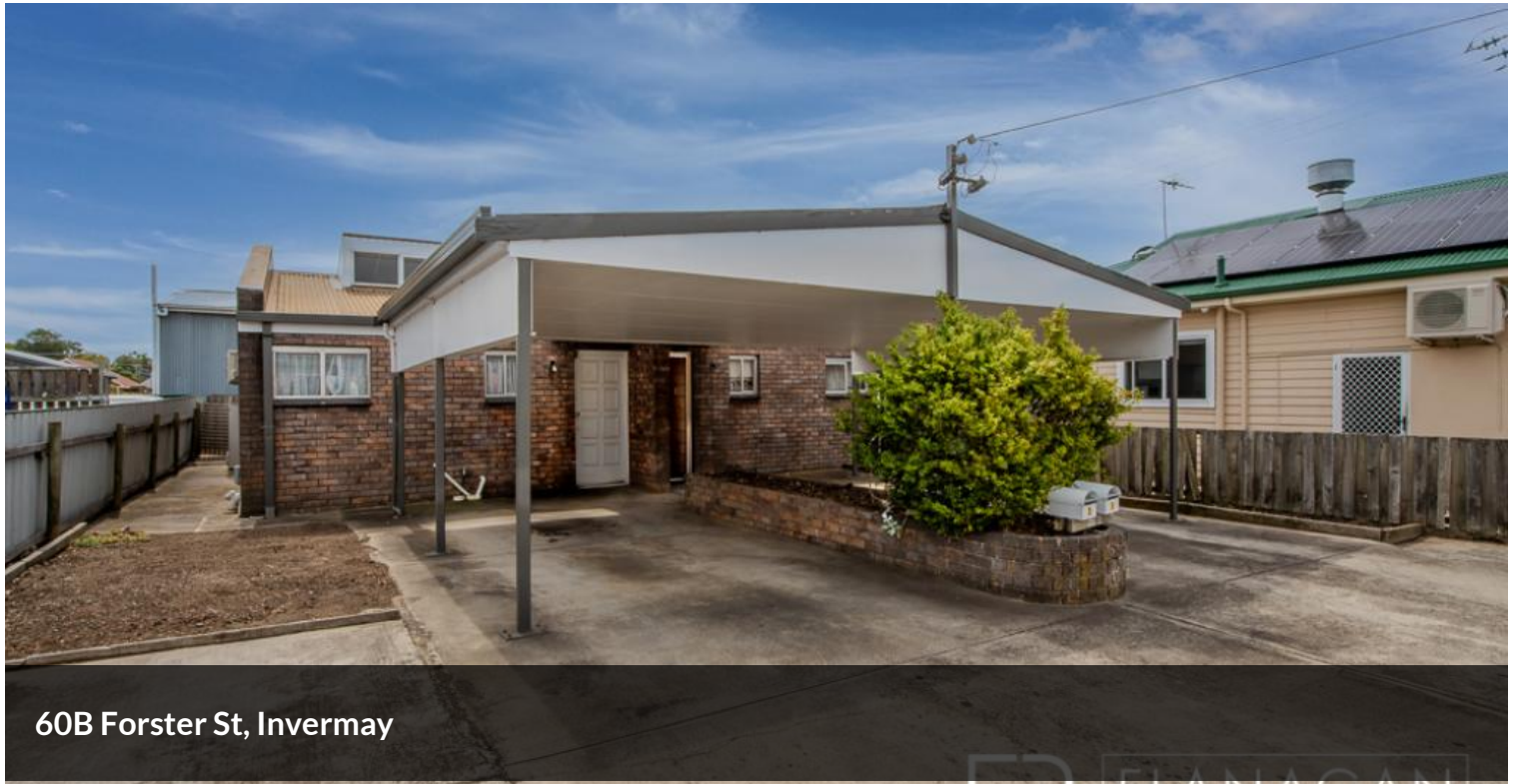
60B Forster St, Invermay